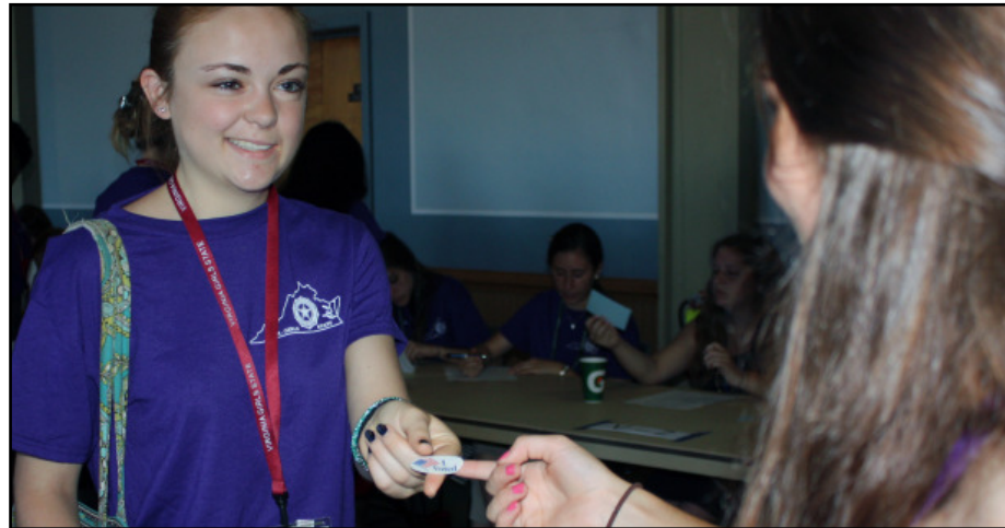
A Girls State citizen receives her "I Voted" sticker from a Girls State election official.

As I stand at the podium and look out to the audience, my nerves are instantly killed. My city gives me hopeful looks and I think to myself, "I love these girls." Over the past few days, I've developed an unbreakable