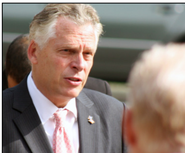
Virginia's Gov. Terry McAuliffe.

The afternoon was filled with activities, the band and chorus concert and the MIA/POW ceremony.